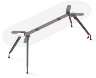
Power Management for LX2 LX2 电源管理