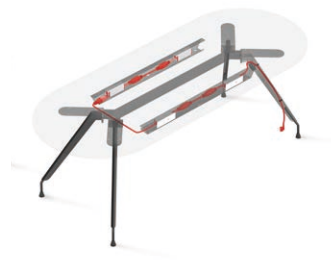
Power Management for Socket Beam 插座梁电源管理