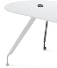
LX2 Socket and Cable Management LX2 走线管理